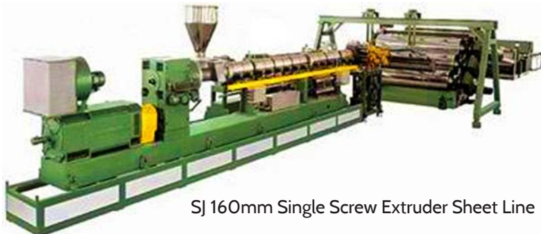
SJ 160mm Single Screw Extruder Sheet Line

SJ Series of extruders offer the best in value single screw extruders available on the market today. Manufactured with advanced designs that use high capacity bearings and torque limiters for long life while giving you high output at a low cost. SJ Series extruders can be used for many applications such as: sheet lines, profile lines, pelletizing, reprocessing and compounding lines. Some available options to choose from are as follows: