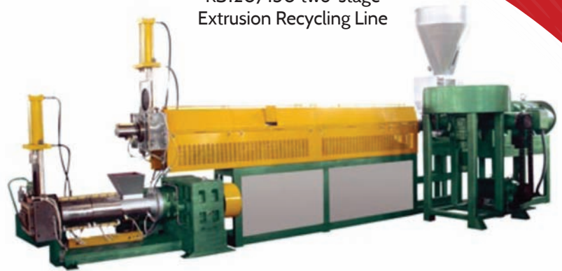
KS120/130 two-stage Extrusion Recycling Line

KS Series of extruders are specialized systems for recycling scrap materials (film, sheet, pipe). They incorporate the same designs as the SJ series but run the scrap material through two single screw extruders for added screen filtration and gasing of the material. This series of lines offer a high degree of automation which allows for high production output while maintaining quality product.