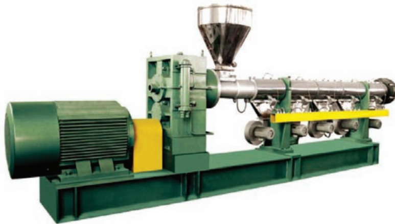
SJ 120mm Single Screw Extruder 24:1 L/D